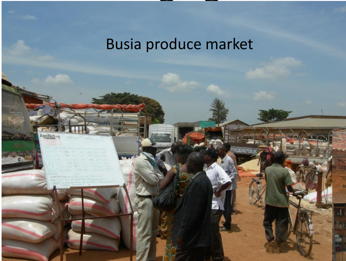
Busia produce market